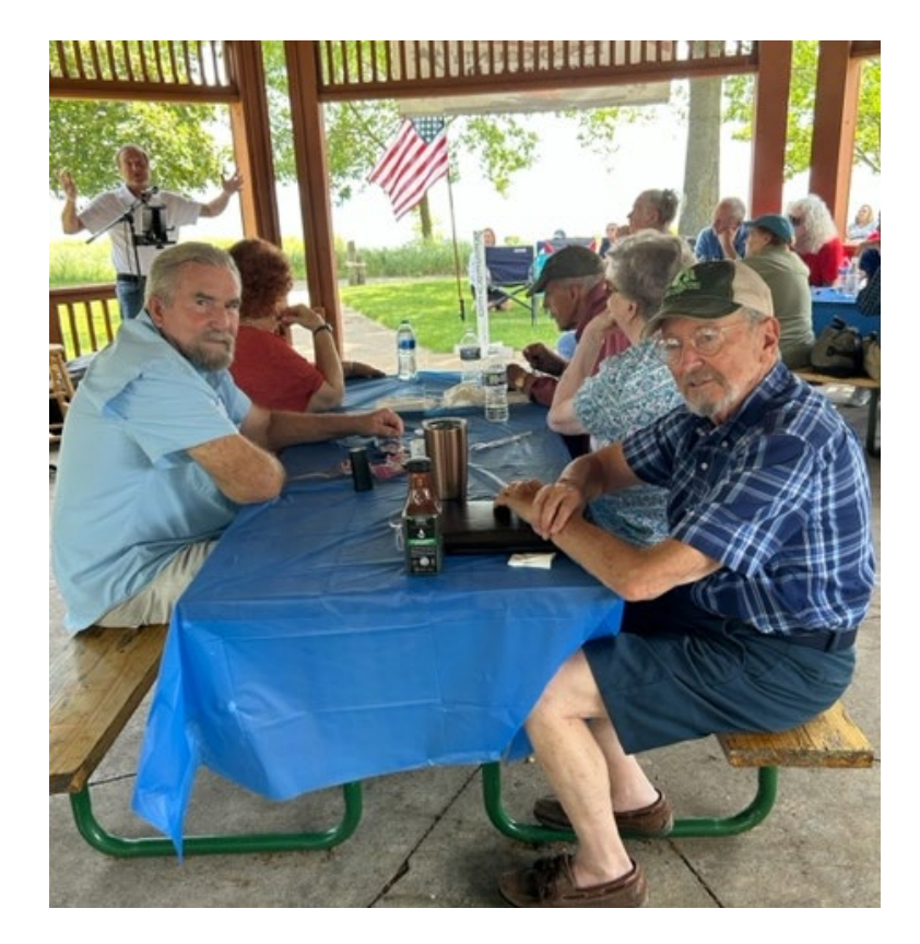
Picnic in the Park July 2023