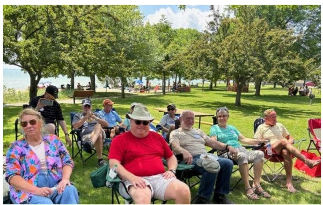
Picnic in the Park July 2023