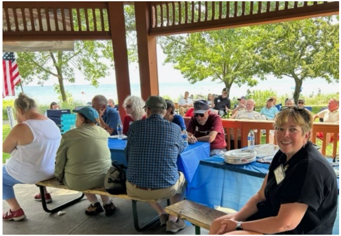
Picnic in the Park July 2023