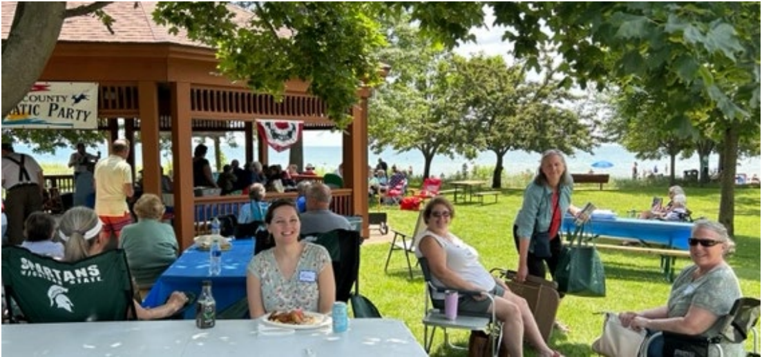
Picnic in the Park July 2023