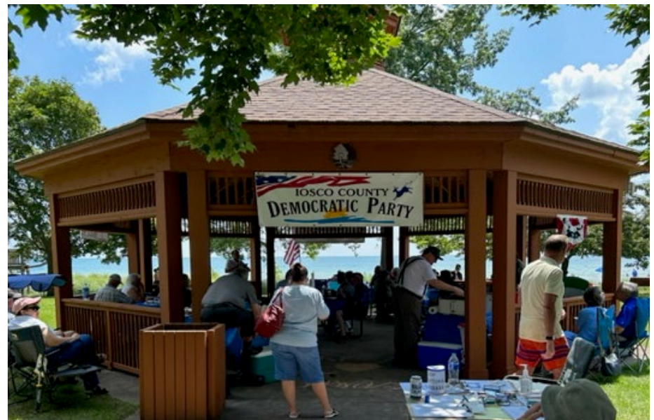
Picnic in the Park July 2023