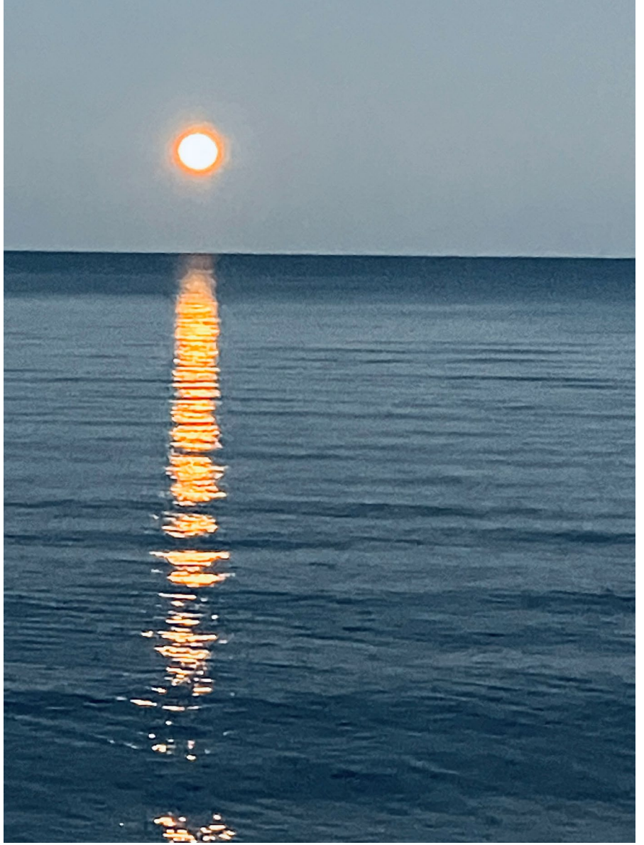
Blue Moon over Lake Huron August 30, 2023 - Richard Douglass