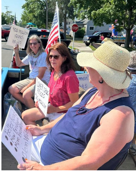
Oscoda Parade July 2023