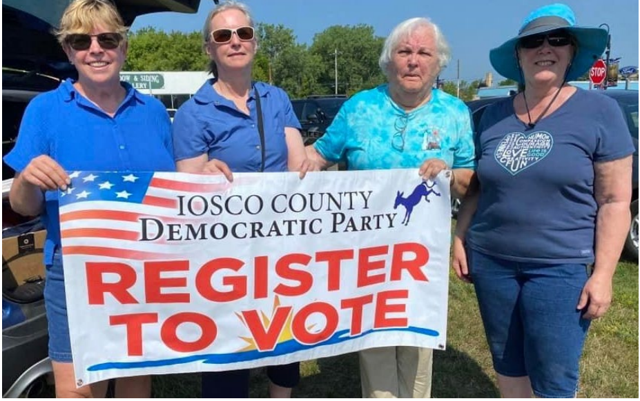
Oscoda Parade July 2023