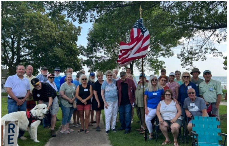
Picnic in the Park July 2023