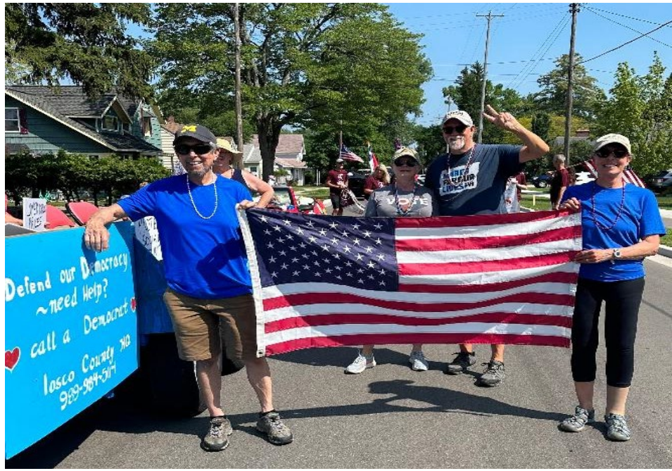
Oscoda Parade July 2023