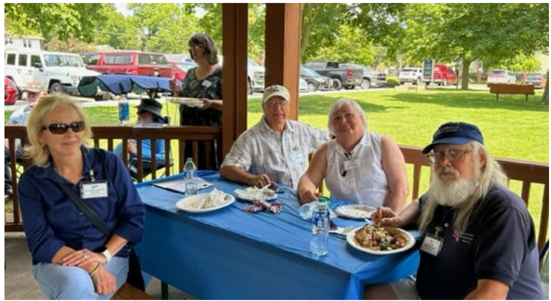
Picnic in the Park July 2023