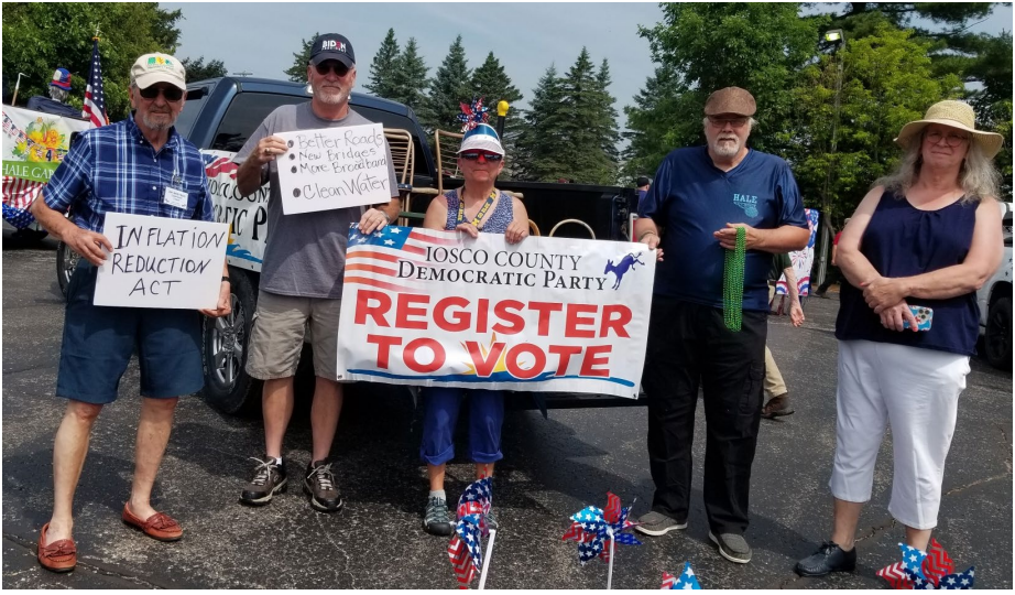
Hale Parade July 2023